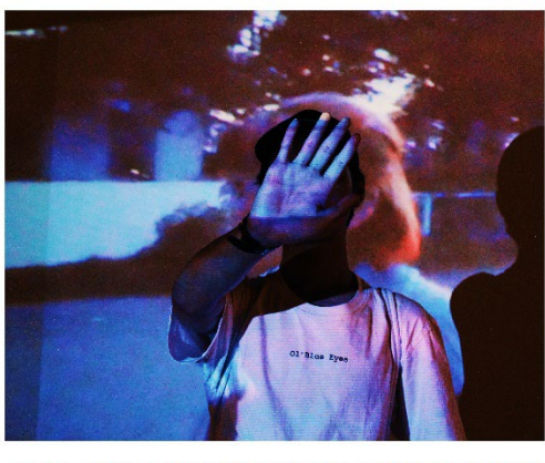
CALL FOR ARTISTS | VIDEO INSTALLATION SUBMIT BY FRIDAY, MAY 6 • torpedofactory.org/artopps

Target Gallery will be hosting a pop-up video exhibition in Studio 9 of the Torpedo Factory Art Center during the