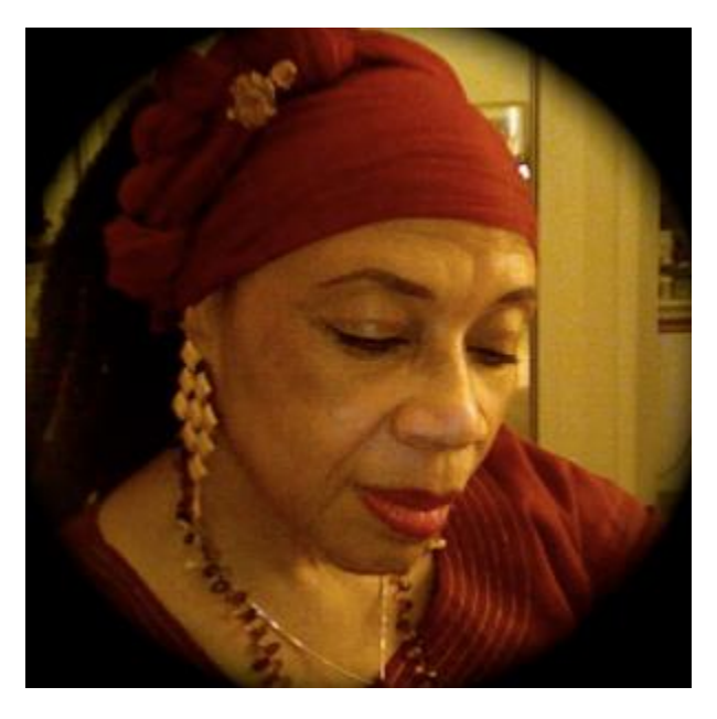
profile on thalo.com

the same consideration when teaching and her passion for the arts is intertwined with her care for students in the classroom.